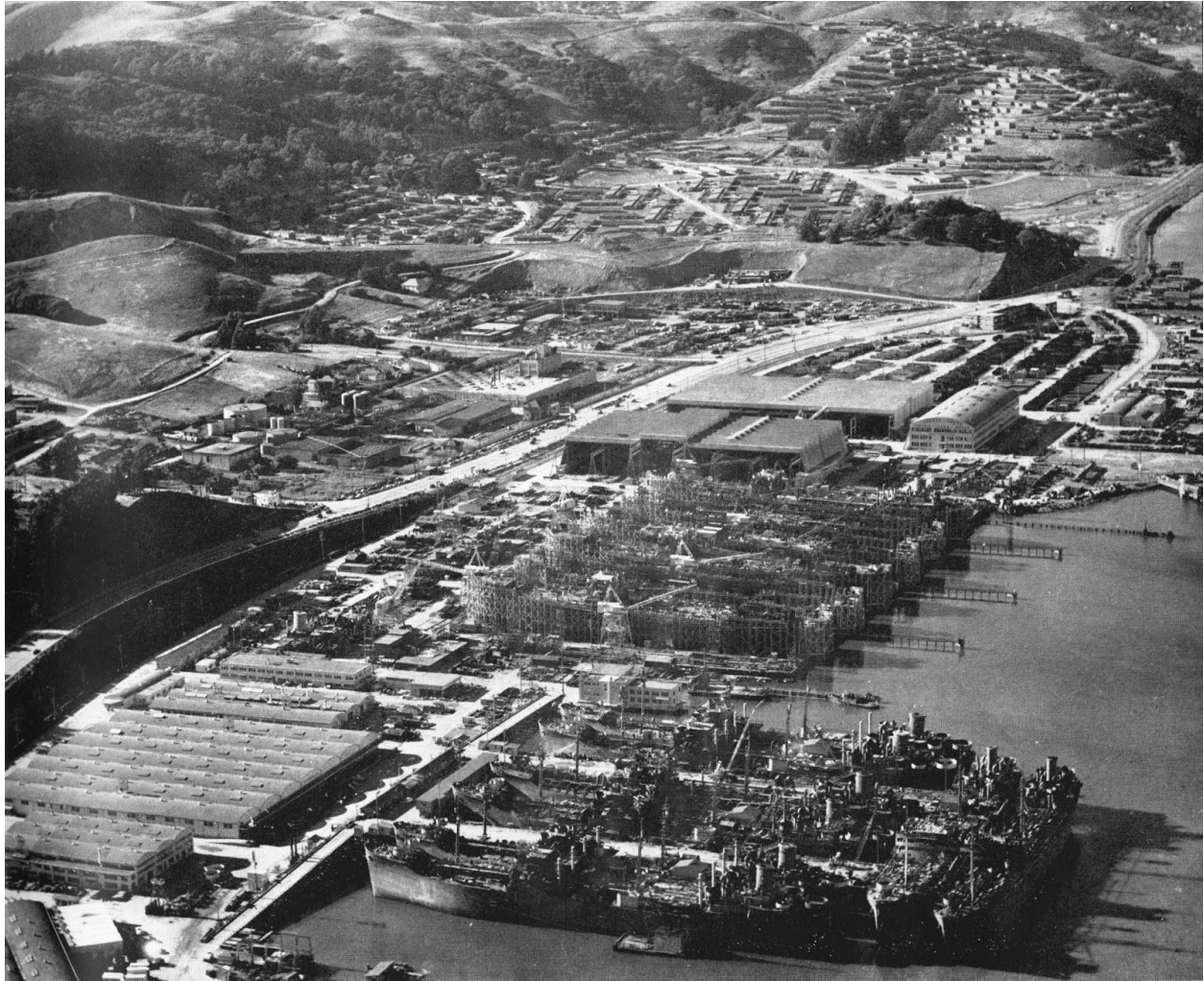
The ICB is the large building with the curved roof at the top right of this photo of Marinship during WWII. Formerly the Mold Loft and Yard Office, it became a haven for artists after the war. In the foreground are Liberty Ships under construction.