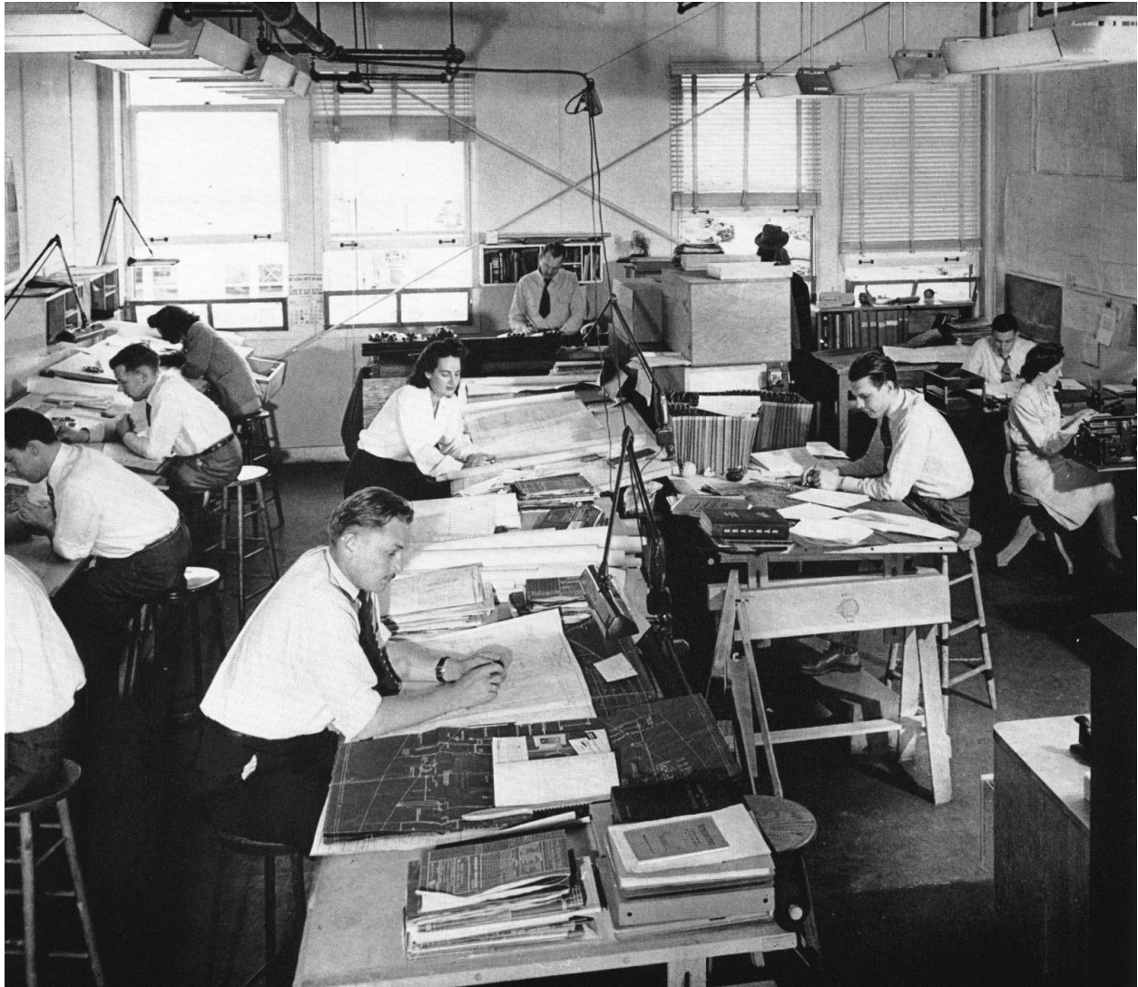
The second floor of the ICB during WWII, where plans for Liberty Ships were designed and developed.