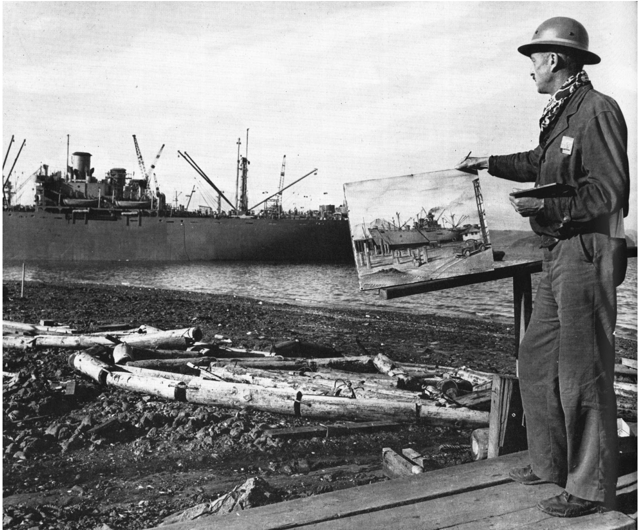
A Marinship Yard worker plein air painting a Liberty Ship during WWII. A fitting start to the current use of the ICB with "One Hundred Artists Under One Curved Roof."